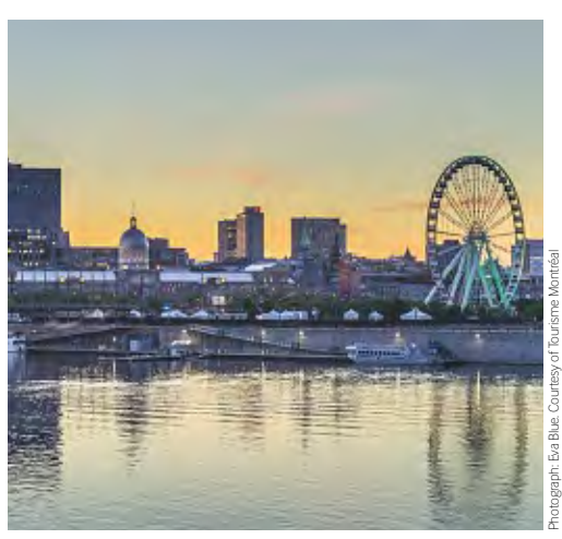
Shining reputation: Montreal is a major player in software and IT services

This year, Greater Montreal won the award for fDi Magazine's best FDI Strategy in the Digital Economies of the Future ranking. Montreal is a major player in software and IT services and leading companies – among them CGI, IBM, Google, SAP, Accenture, Fujitsu, Autodesk, Tata Communications, and Dassault Systems – have centres there.