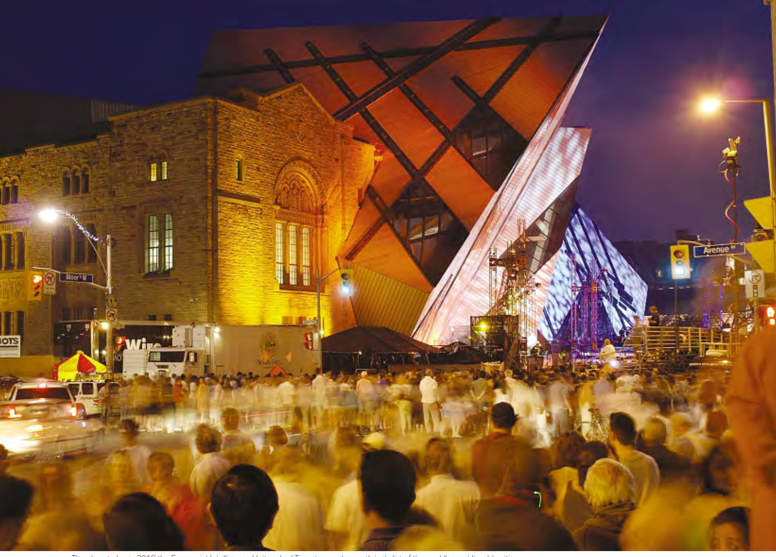
The place to be: in 2018 the Economist Intelligence Unit ranked Toronto equal seventh in its list of the world's most liveable cities